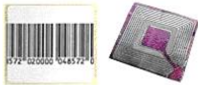
Figure 4. A RF barcode sticker that functions as a security device, complete with a tank circuit on its back. The tag can be made useless by breaking the circuit, for instance by slicing through the sticker with a razorblade or Xacto knife.

Aside from the 90% of books with no protection, and the 1% (I'm pulling numbers out of a hat...which is to say my ass) of potentially source-tagged books, a small percentage of books have a primitive stick-on RF barcode sticker. These puppies typically look like so: