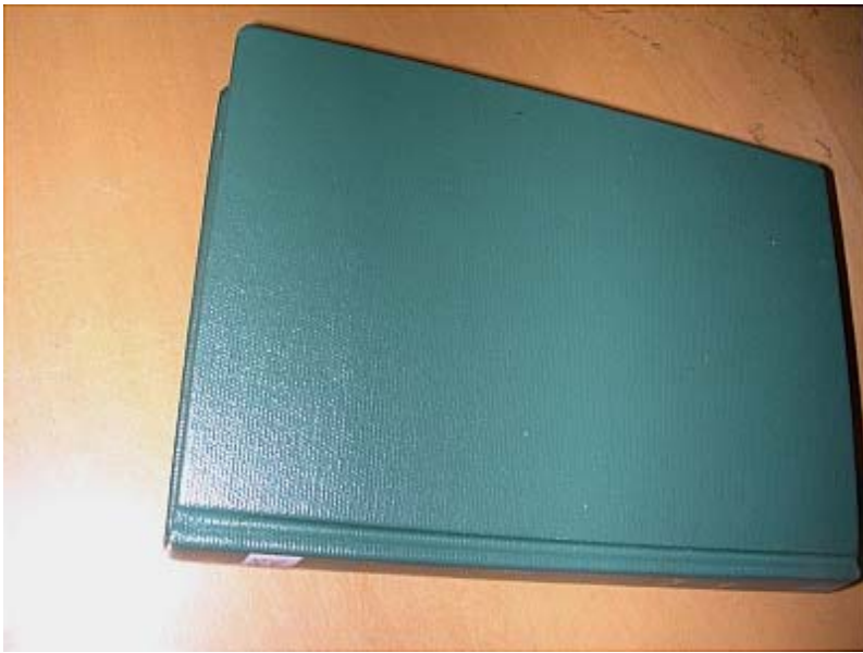
Figure 1. Your everyday, run of the mill library book, complete with the standard library binding glued over the book's own cover.