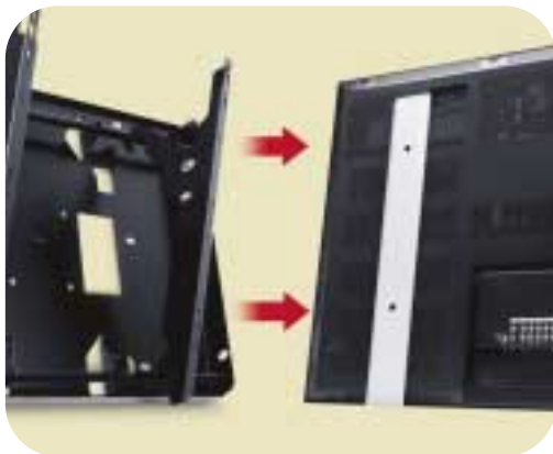
Put more visual flair into any viewing environment with the optional wall or ceiling mount.