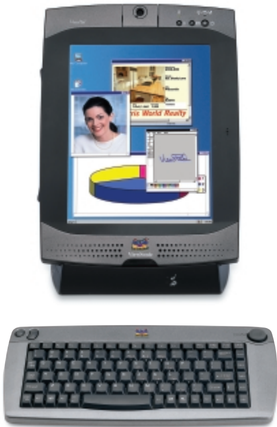
ViewPad Wireless Keyboard included.