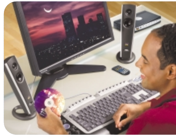
Turn your CRT or LCD monitor into a high-resolution TV with the N5 TV/video processor.

Create your own desktop entertainment center with the ViewSonic N5 TV tuner/video processor. This compact box easily turns any LCD or CRT monitor into a TV multimedia center. With a BUILT-IN TV TUNER AND MULTIPLE VIDEO CONNECTIONS for extras like a DVD player, digital camera, VCR or game consoles, you can view multimedia presentations or catch the end of the game – all in FULL-SCREEN, HIGH RESOLUTION IMAGES . Content can even be filtered with the built-in V-chip. With the N5, it's easy to plug and play TV, DVDs and more right at your desk and still have room to work. Add an UltraBrite™ or DigitalMedia ViewSonic display for the ultimate desktop entertainment experience.