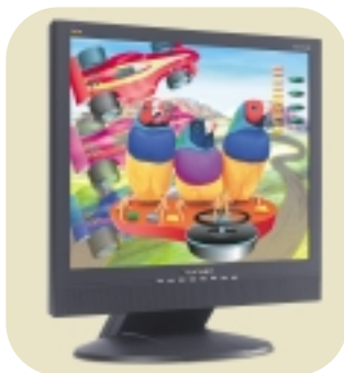
With the ViewSonic N5 TV/video processor and an UltraBrite or DigitalMedia ViewSonic display you get the ultimate desktop theater experience.

Connect your DVD player, VCR, digital camera, camcorder or gaming console to enjoy brilliant images on your high-resolution display.