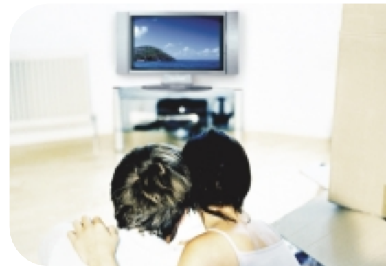
Remarkable home entertainment.

in-picture (PIP) capability so you can both watch what you want. The N3020w continues ViewSonic's tradition of quality and performance while unveiling the next step in dramatic home entertainment.