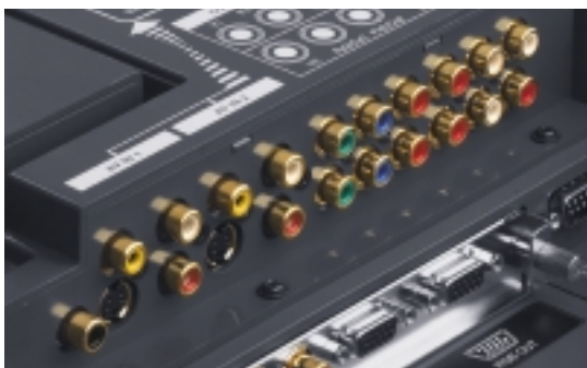
The N3020w features a number of input connections to ensure long-term compatibility with evolving technology.