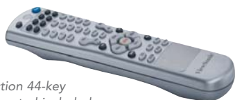
Full-function 44-key remote control included