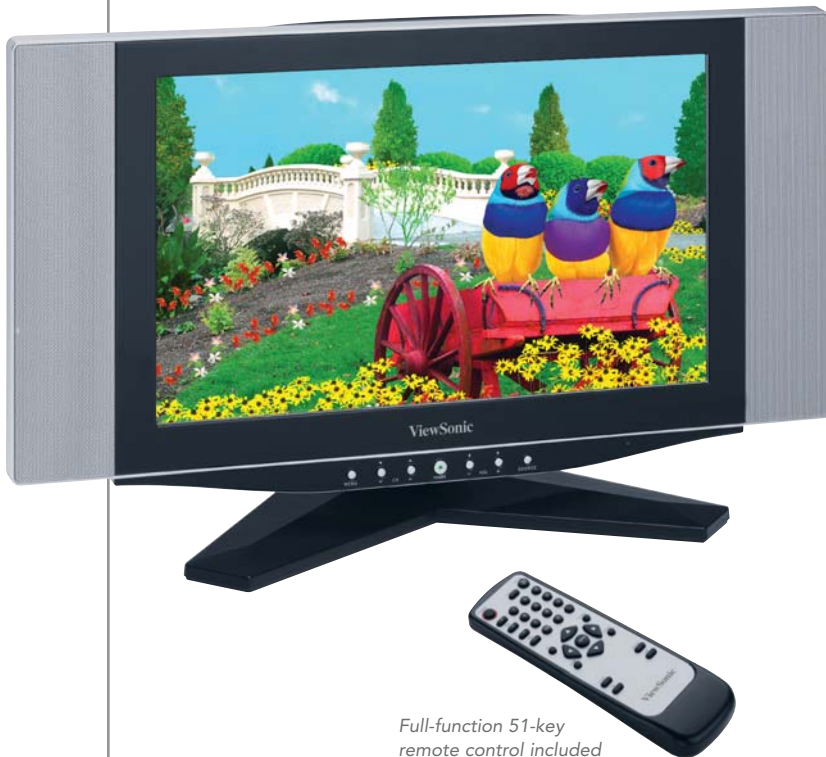
Full-function 51-key remote control included

It's not just an LCD TV. It's a ViewSonic.