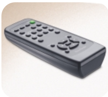
Easy-to-use remote included.

Connect two computers simultaneously or add a video source for dynamic meetings.