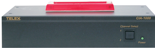
Standard Top-Mounted Light