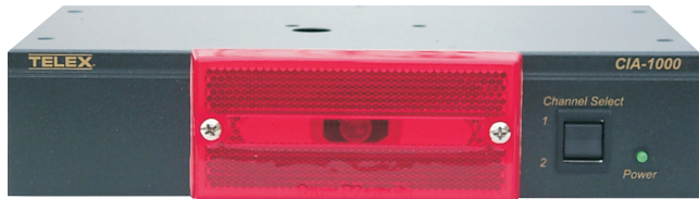
Optional Front-Mounted Light