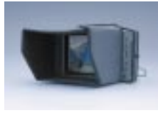
Monitor with Viewing Hood

The monitor incorporates a built-in audio amplifier, speaker and headphones jack for general and personal monitoring use.