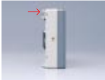
Protects the connector panel