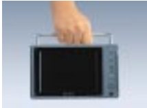
Use as a carrying handle

The monitor stand can also be used as a carrying handle. When not in use for either of these functions, it is stored in the rear panel where it protects the connectors.