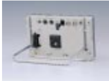
Use as a monitor stand