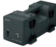
BC-L100 Battery Charger