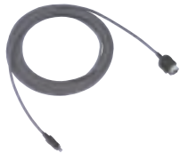
CCFD-3L (4-pin to 6-pin with lock) CCF-3L (6-pin to 6-pin with lock) i.LINK Cable