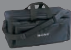
LC-300SZ Soft Carrying Case