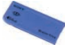
MSA-4A/8A/16A/32A/64A IC Recording Media Memory Stick