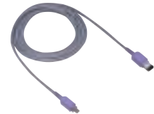
VMC-IL4615/4635 (4-pin to 6-pin) VMC-IL6615/6635 (6-pin to 6-pin) i.LINK Cable