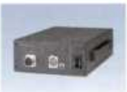
AC Adapter AC-550/550CE