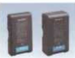
Rechargeable Lithium-ion Battery BP-L60/L90