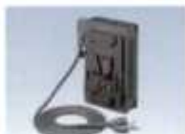
AC Adapter AC-DN1