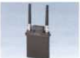
Wireless Microphone Receiver WRR-855A