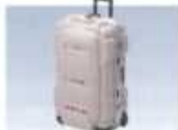
Carrying Case LC-DN5