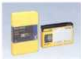
Betacam SX Video Cassette BCT-12SX/22SX/32SX/60SX