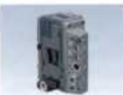
Camera Adapter CA-701