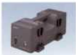
Battery Charger for four BP-L60 and BP-L90 Batteries BC-L100/L100CE