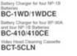
Battery Charger for four MP-18 Batteries BC-1WD/1WDCE