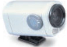
CVX-V3 Color Video Camera with Built-In 3x Zoom (3.5-10.5mm)