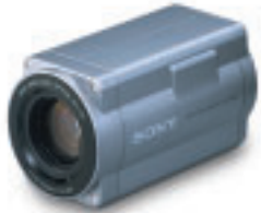
CVX-V18NS/SEC NightShot™ Color Video Camera with Motorized 18x Optical Zoom Lens (2x Digital)