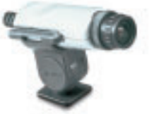
CVX-V1 Color Video Camera with Built-In Wide Angle Lens, 39mm