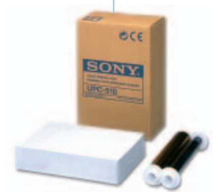
UPC-510 Color Printing Pack

*USB 2.0 Compatible with optional LUB-SC2 converter Cable