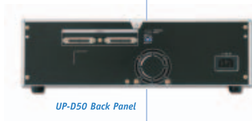
UP-D50 Back Panel