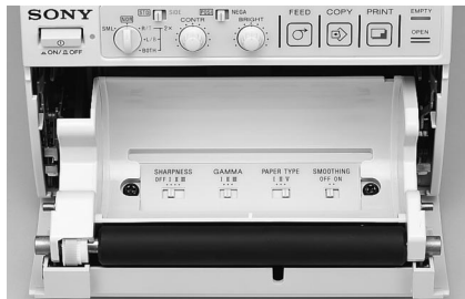
FRONT PANEL VIEW – UP-895