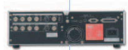
UP-51MD Back Panel