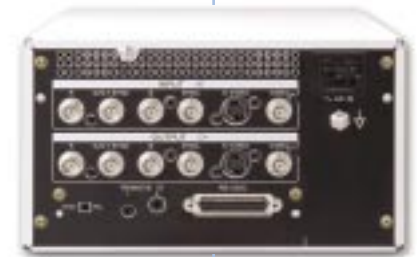
UP-21MD Back Panel