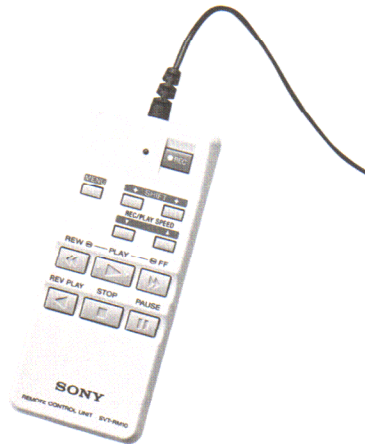
SVT-RM10 REMOTE CONTROL UNIT