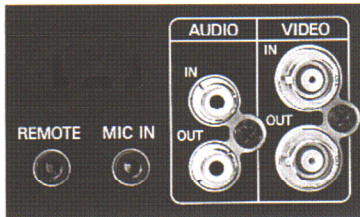
REAR PANEL DETAIL