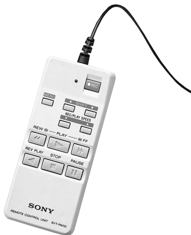
SVT-RM10 REMOTE CONTROL UNIT