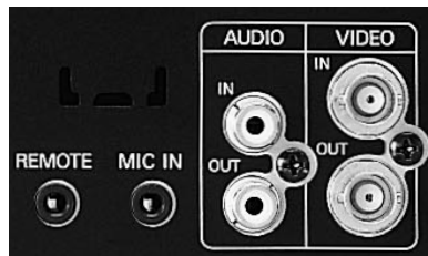
REAR PANEL DETAIL