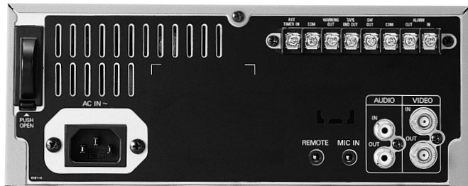
REAR PANEL VIEW