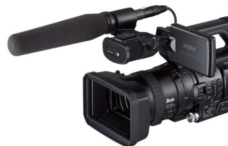
The ECM-678 attached to a Sony camcorder

The vibration-resistant mechanism of the ECM-678 offers high durability and reliability, making it suitable for the harshest environments encountered in the most demanding of sound-acquisition scenarios.