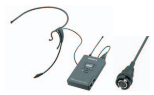
ECM-322BC with WRT-822B

ECM-322BC : Supplied with a Sony 4-pin connector (SMC9-4P) for use with the WRT-8B/822A/822B bodypack transmitter ECM-322BMP : Supplied with a 3-pole locking mini plug for use with the bodypack transmitter included in UWP series