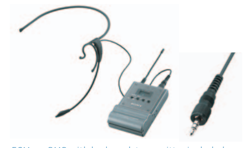
ECM-322BMP with bodypack transmitter included in the UWP-C1/S1/X1 package