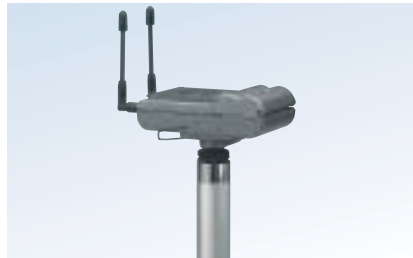
Photo shows portable tuner mounted on a microphone stand.