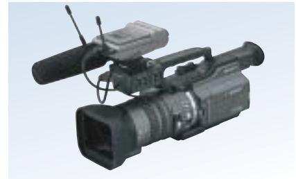
Photo shows portable tuner mounted on a DSR-PD150.