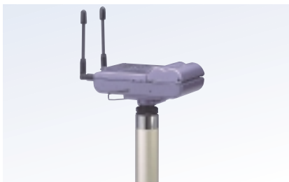
Photo shows portable tuner mounted on a microphone stand.