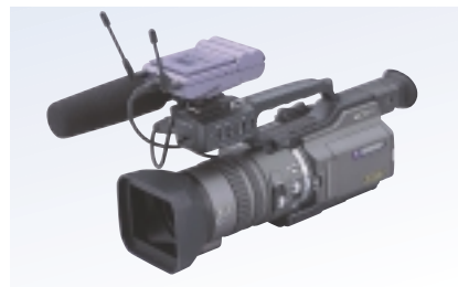
Photo shows portable tuner mounted on a DSR-PD150.