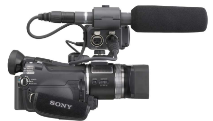
The ECM-673 attached to a Sony HVR-A1 Series camcorder

The built-in two-position (M, V) low-cut switch on the ECM-673 provides a simple method of reducing the effects of unwanted ambient noise.