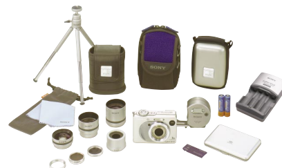
CAMERA WITH OPTIONAL ACCESSORIES

*VAD-WA Conversion Lens Adaptor Mount Required