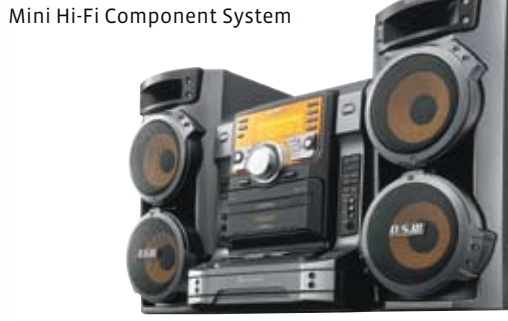
LBT-ZX8 Mini Hi-Fi Component System