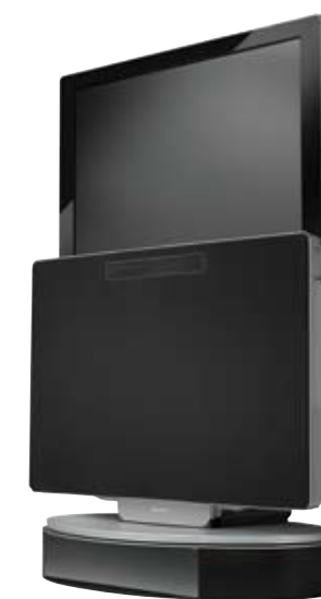
*Shown with an optional stand for cable box.

The Sony TAV-L1 is an all-in-one home theater system which combines a 32 inch LCD monitor with a cutting edge technology home theater system. It features an audio unit with integrated DVD/CD/SACD player and S-Master digital amplifier which slides up or down to conceal or reveal the LCD monitor. TAV-L1 also features S-Force® Pro front surround technology (DSP technology) to envelop you in realistic surround sound without rear speakers. You will also feel the powerful bass sound from the integrated dual sub-woofers. Plus it comes equipped with HDMI. interface to ensure compatibility with the latest digital source.