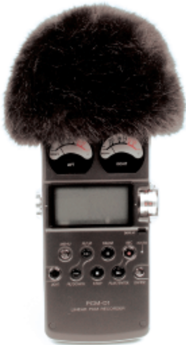
D1 Topper features a faux fur cover