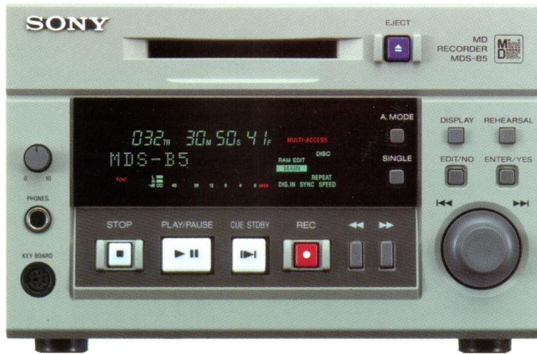
Model shown in photo: MDS-B5