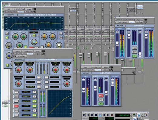
Inflator with the Oxford EQ and Dynamics