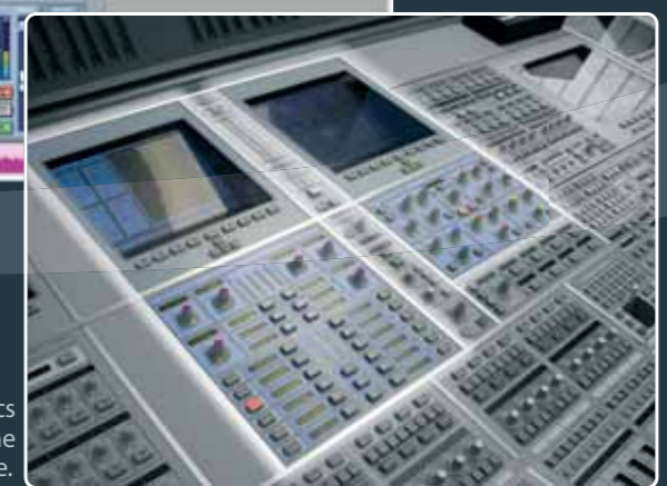
The EQ and Dynamics panels as seen on the "R3" Console.