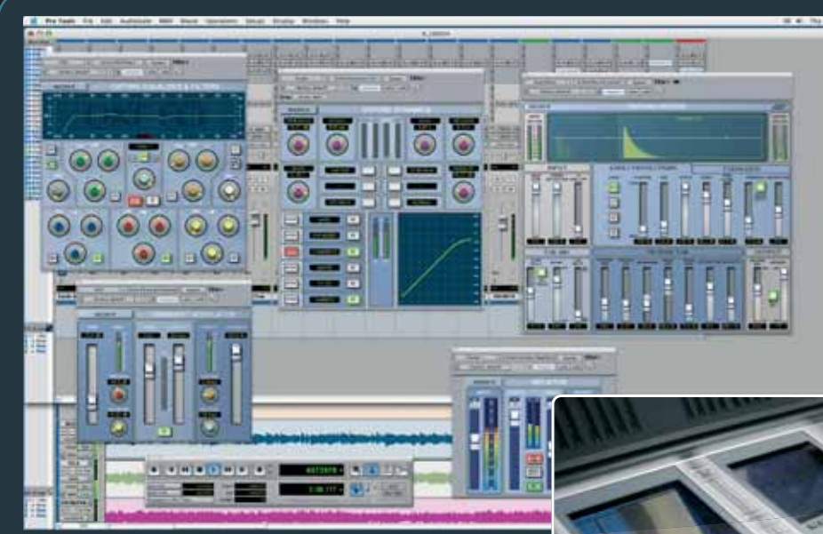
The Oxford Plugins on a Pro Tools TDM System

"The sonic quality is stunning. I have never heard a plug-in based on artificial reverb techniques sound as natural as this. I had the impression of sitting in the room, being able to touch the walls of wood or stone!" Audio Engineer comment