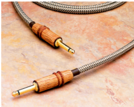
Sir Tweed Woody

Combinations of some of the above are also available, for instance, a Sir Tweed with cocobola wood handles and 2 gold straight plugs. Call for pricing.