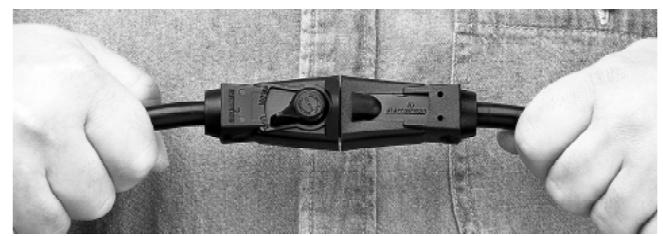
Tru Link locks the extension cords together so that they will NEVER come undone, no matter how hard you pull!*.