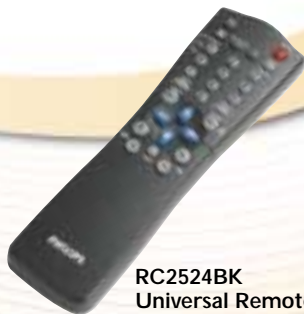
RC2524BK Universal Remote