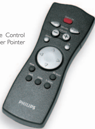
Remote Control with Laser Pointer