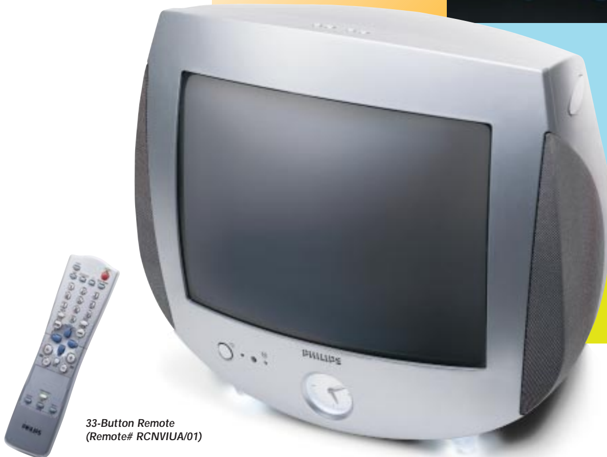
33-Button Remote (Remote# RCNVIUA/01)