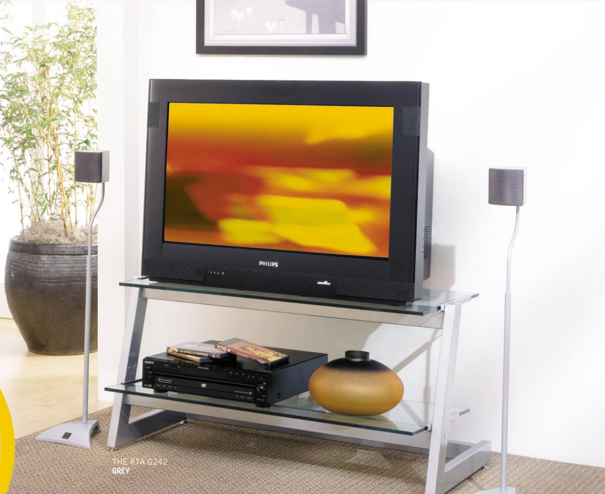
THE RTA G242 GREY