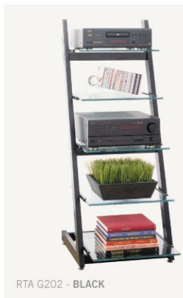
RTA G202 - BLACK

STEEL AND GLASS ARCHITECTURE OF CLASSIC PROPORTION