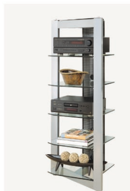
THE COSMIC AUDIO TOWER - GREY

HOME THEATER FURNITURE THAT'S OUT OF THIS WORLD