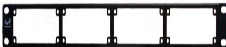
RACK MOUNTING USING THE NIGEL B 1U OR 2U RACKFRAME™