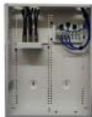
Structured Wiring Panel