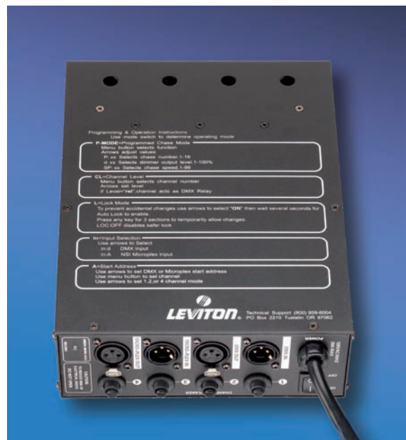
D4-DMX (side view)