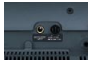
Microphone/Guitar Input with Level Control