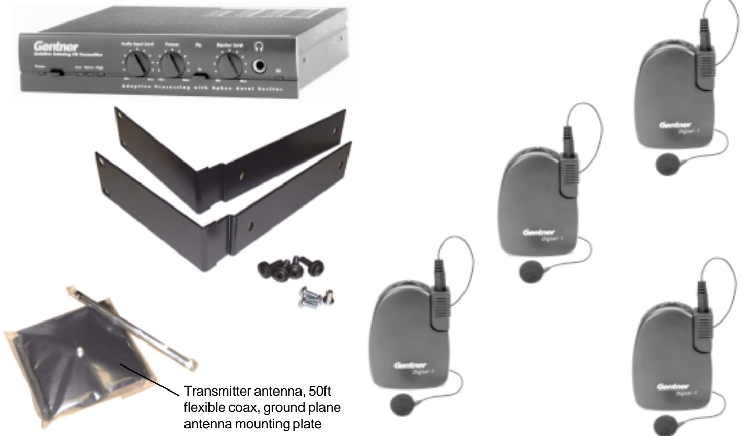
Transmitter antenna, 50ft flexible coax, ground plane antenna mounting plate

The Digital Package includes one TX-37A, four Digital-1s, one plaque, one window sticker, transmitter antenna, 50ft flexible coax, ground plane antenna mounting plate, and one rack mount kit. This system is designed for facilities with 100 seats, but is expandable to accommodate facilities with 4000+ seats