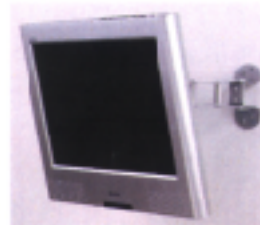
Wall Mount with cantilever arm 15° tilt, and 180° side to side rotation