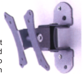
Wall Mount w/15° tilt and 180° side to side rotation