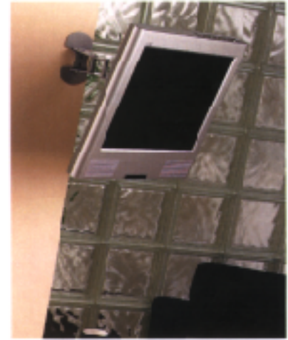
Wall Mount w/15° tilt