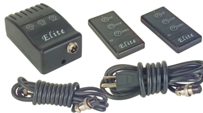
Remote Control and 3-Way Wall Switch IR + RF Remote