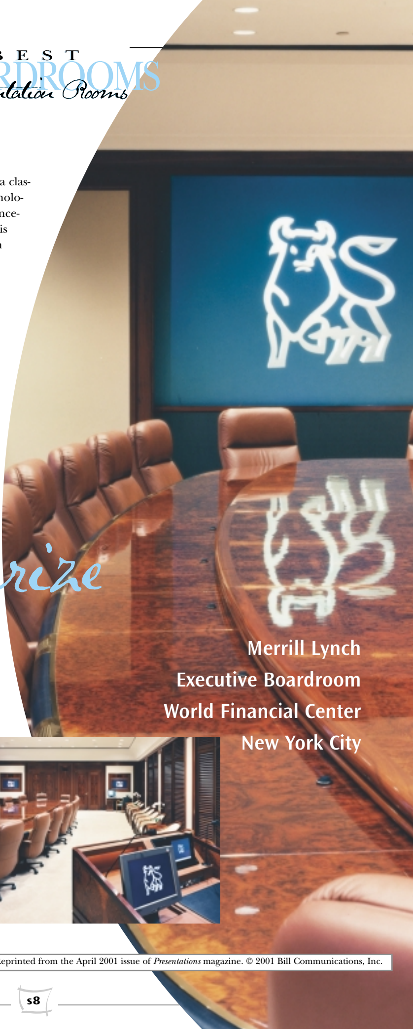
Merrill Lynch Executive Boardroom World Financial Center New York City