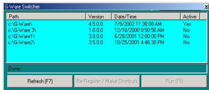
Figure 2. G-Ware Switcher

If it is active, simply click Run . The selected G-Ware version will start.