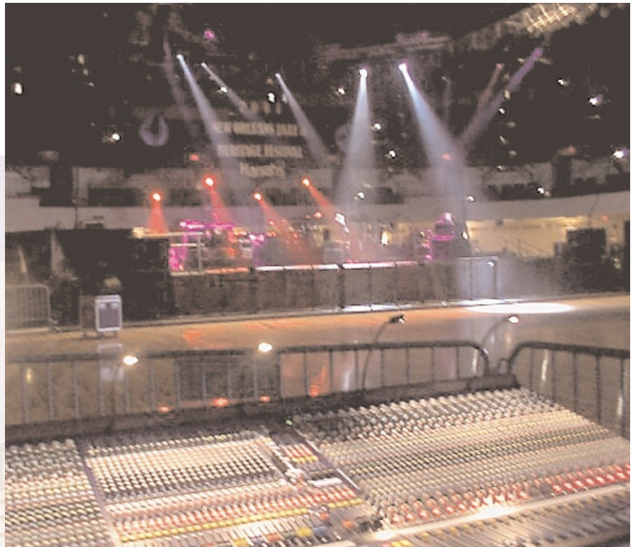
A view from FOH to the main stage.