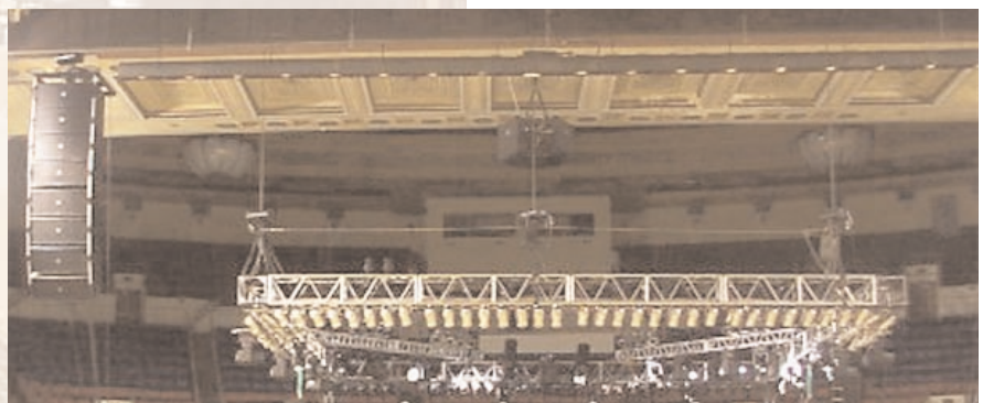
One of the X-Line hangs faces the main seating area.