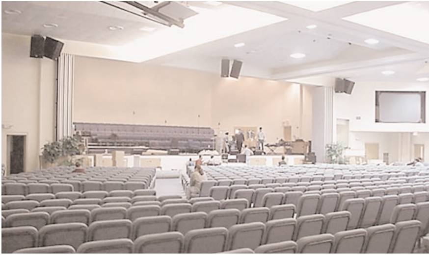
Electro-Voice's Xi speakers provide coverage for the main sanctuary.