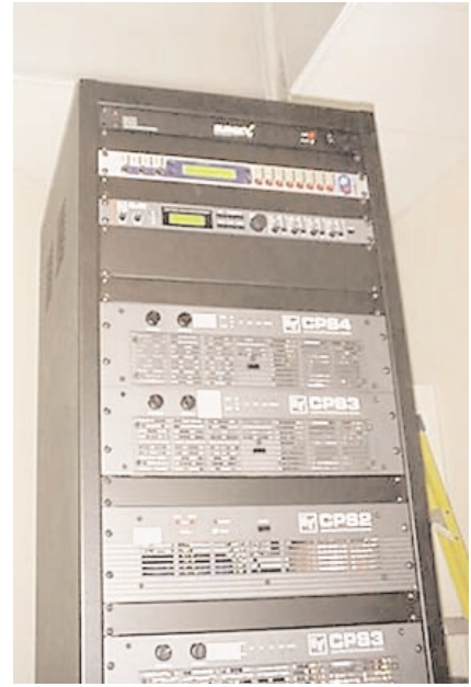
Tower of power: from top, KT DN 9848, EV DX 38 processors; EV CPS amps.

Contact information: Chip Self, Logic Systems Sound; 314-968-4050 ph; chip@logicsound.com