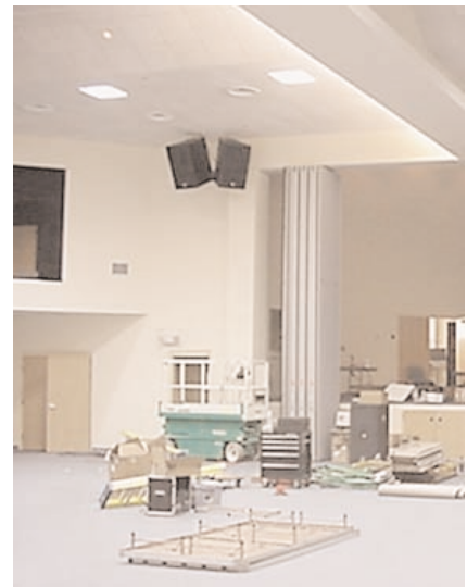
House left during installation