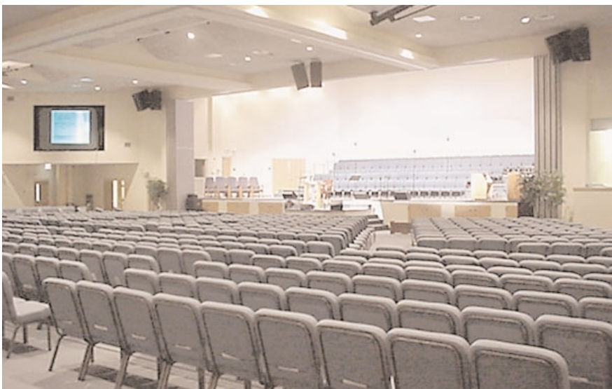
Another view of the main sanctuary.