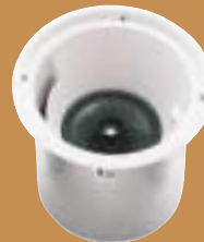
EVID C8.2HC THE EXCLUSIVE "PATTERN CONTROL" SOLUTION