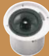
EVID C8.2 THE FULL RANGE POWERHOUSE