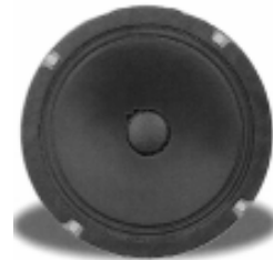
307 FAMILY Utility Ceiling Speakers

These high performance full range speakers are the speakers true professionals choose. Available in an 8 ohm or transformer configuration. Choose between two different transformers - 8 or 16 watts. Freq. Resp = 65 - 15,000 Hz; Max SPL = 105 dB.