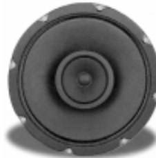
309 FAMILY Standard Duplex® Speakers

The 409's are 32 watt, full-range coaxial loudspeakers. The "T" versions are available from 4 to 32 watts. They can also be purchased with a grill. Freq. Resp. = 85-18,000 Hz; Max SPL = 112dB.