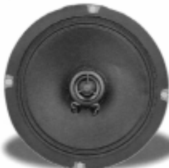
407 FAMILY Premium Ceiling Speakers

These high performance full range speakers are the speakers true professionals choose. Available in an 8 ohm or transformer configuration. Choose between two different transformers - 8 or 16 watts. Freq. Resp = 65 - 15,000 Hz; Max SPL = 105 dB.