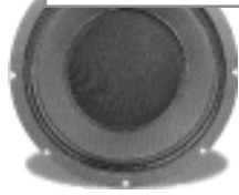
509 FAMILY Extended LF Ceiling Speakers

The 509's are 30 watt, full-range 2-way loudspeakers. The "T" versions are available in either 5 or 30 watt. They can also be purchased with a grill. Freq. Resp. = 80-16,000 Hz; Max SPL = 110dB.