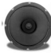
209 FAMILY Utility Ceiling Speakers

The 309's are 15 watt, full-range coaxial loudspeakers. The "T" versions are available in either 4 or 8 watt. They can also be purchased with a grill. Freq. Resp. = 85-18,000 Hz; Max SPL = 108dB.