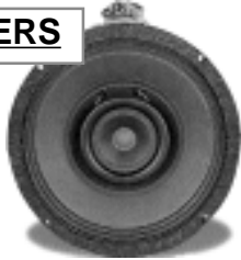
409 FAMILY Premium Duplex® Speakers

The 509's are 30 watt, full-range 2-way loudspeakers. The "T" versions are available in either 5 or 30 watt. They can also be purchased with a grill. Freq. Resp. = 80-16,000 Hz; Max SPL = 110dB.