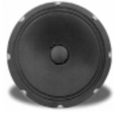
109 FAMILY Economy Ceiling Speakers

The 209's provide 10 watts of power and are available in 8 ohms or with a transformer and grill. Freq. Resp. = 80-15,000Hz; Max SPL 104dB @ 8 ohms / 101dB w/ transformer.