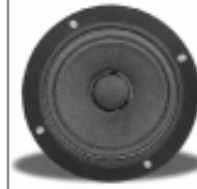
205 FAMILY Utility Ceiling Speakers

Because quality is always a concern, these speakers are not a compromise. Full Range / High Performance in both 8 ohm and 70/100 volt applications. Freq. Resp. = 60 - 15,000 Hz; Max SPL = 102 dB